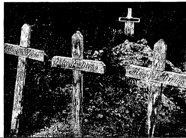
Spoils of war: The Croatian city of Vukovar is a ruin two years after the 87-day siege in which Serb fighters wrested it from Croat forces. A boy looks for undamaged roof tiles, left. At top, a pockmarked sign and building mark both the edge of the city and its destruction. Above, wooden crosses in Vukovar's cemetery stand above the tightly packed graves of war victims.